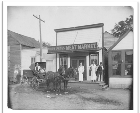
Pictured on right: Spring Forest Deli

Our monthly meetings are held on the third Monday of the month at 7:00 p. m. at the Community Center (8156 S Archer Ave.) Hope to see you there!!